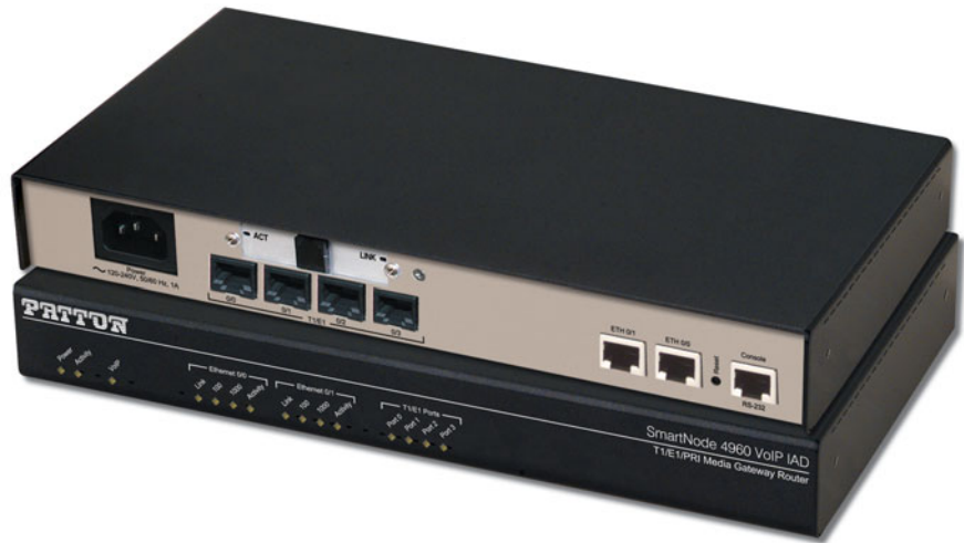
SmartNode 4960 with Integrated G.SHDSL.bis